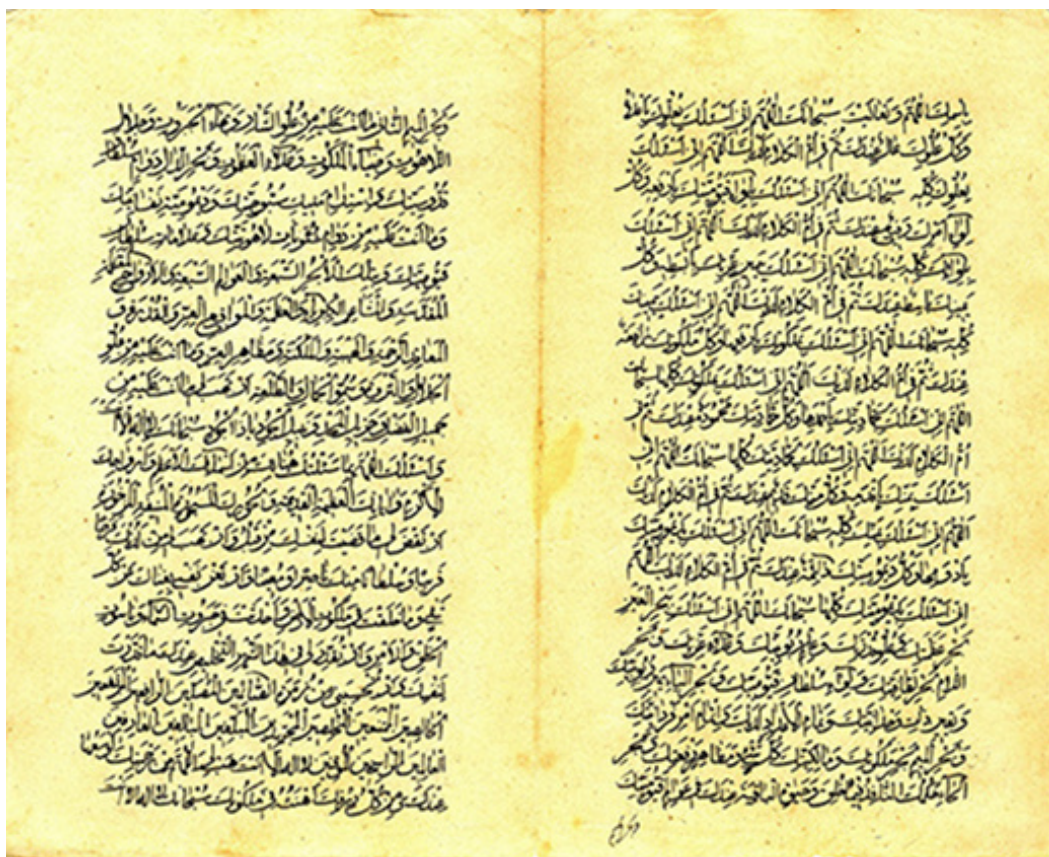
Figure 2: folio 3-1