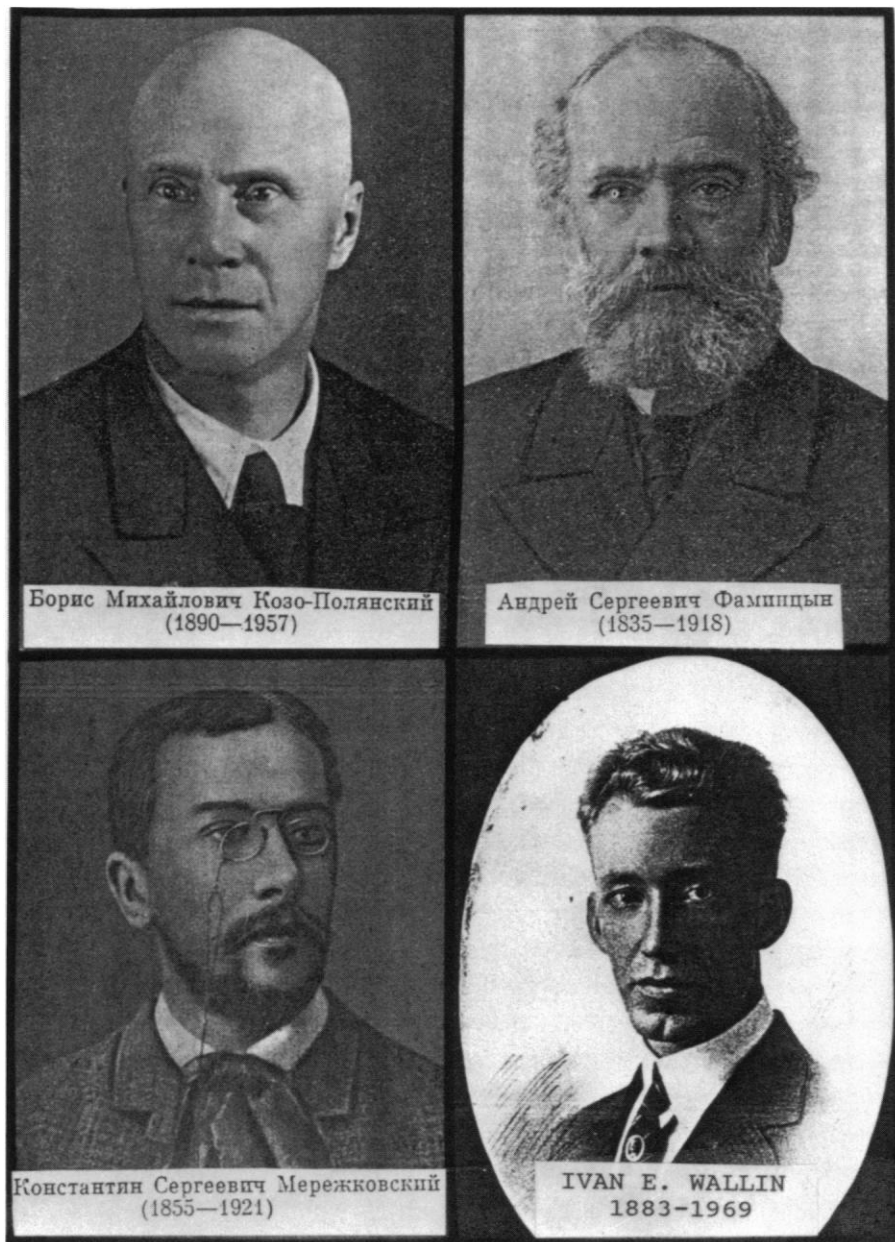
Figure 2. The symbiogeneticists: Boris M. Kozo-Polyanski, Andre S. Famintzin, Konstantin S. Mereschkovsky, and Ivan E. Wallin.

Paul Portier, a French contemporary of Wallin, also emphasized the importance of symbioses in evolution (Margulis 1981, Portier 1918). Although Portier was supported by the king of Monaco, he too was aggressively attacked. The French scientific